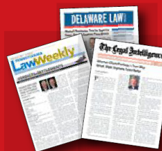
Hard Copy Reprints